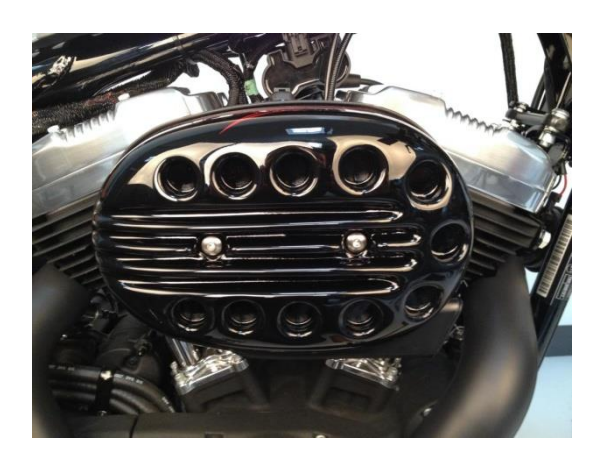
Abb. 1 – Mounted air filter cover "Slotted"

We recommend using a medium-strength screw lock (e.g. LOCTITE 243, blue) for all screws.