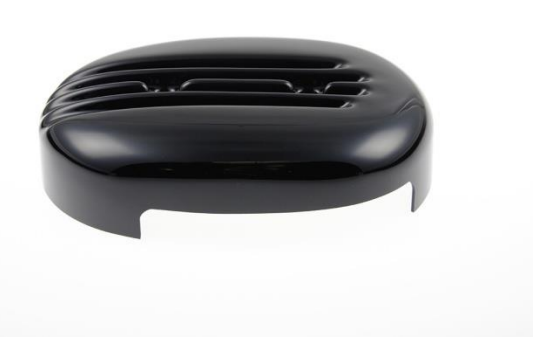
Abb. 2 – air filter cover "FIN"